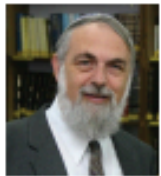
RAV YOSEF CARMEL