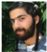
RAV SHIMON BERMAN